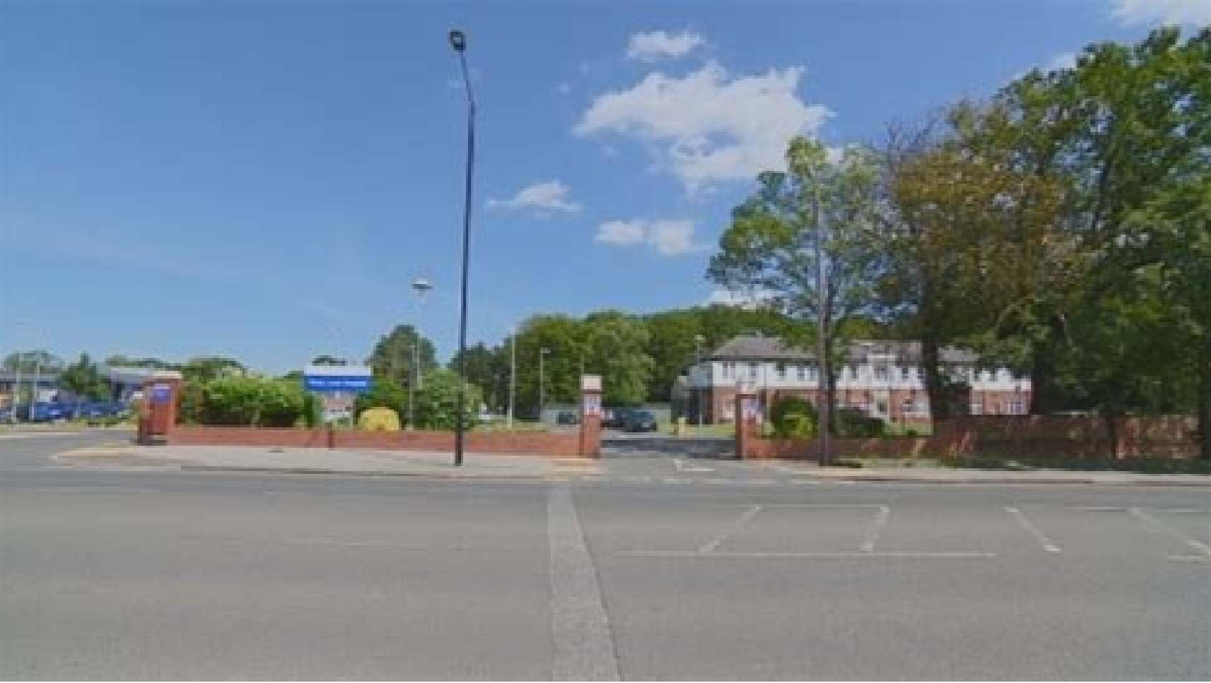
Cqc report rampton hospital 2019.